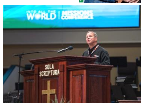
We are to GO and SPREAD THE GOSPEL to ALL!